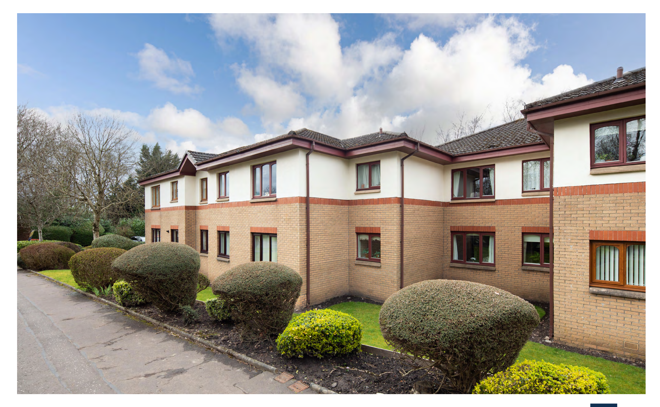
6 The Forge, Braidpark Drive, Giffnock