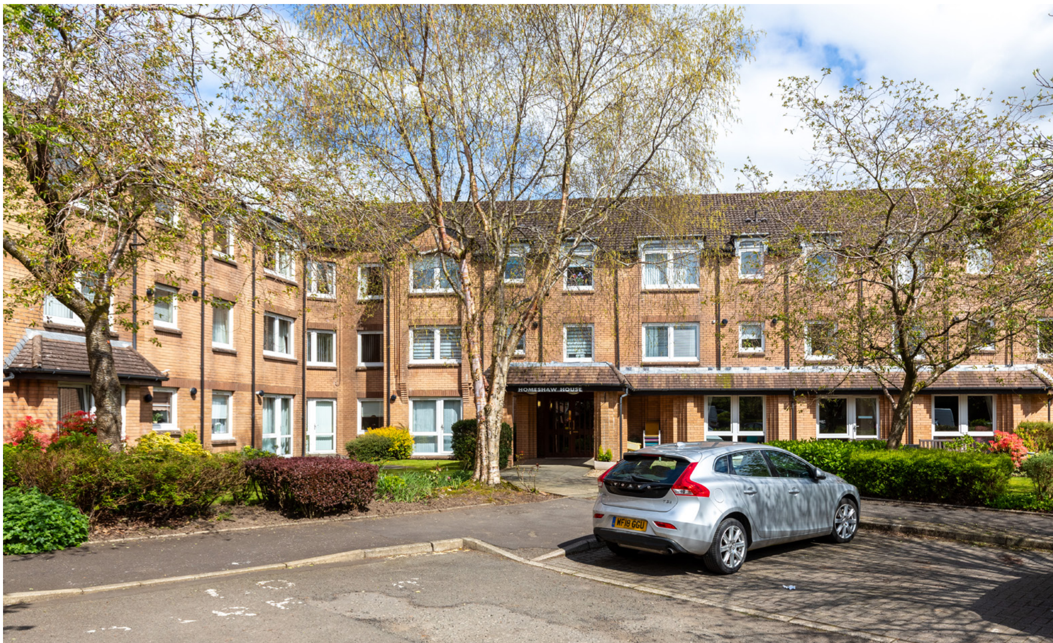
9 Homeshaw House, 27 Broomhill Gardens, Newton Mearns