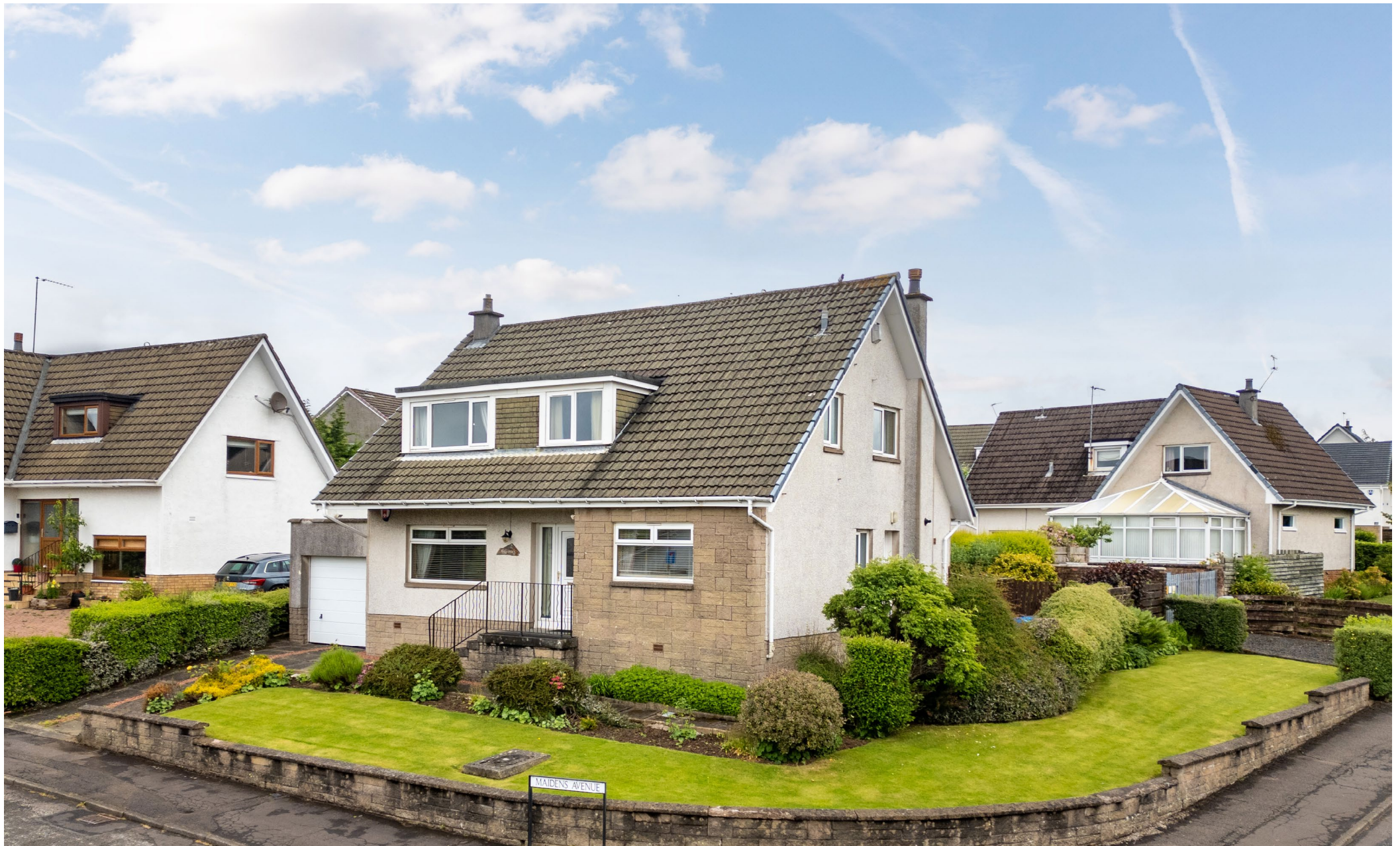
2 Maidens Avenue, Newton Mearns, G77 5SL www.nicolestateagents.co.uk